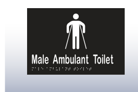
Male Ambulant Toilet Sign Code: MLS16246_BLK