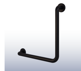
90° Ambulant Grab Rail 450mm x 450mm Code: MLR112_DESIGNER