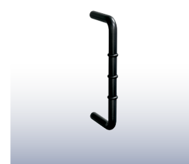
D Handle with Rubber Stopper Code: ML315_DESIGNER