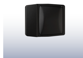
Moda Bumper Code: MODA_BUMPMKII_DESIGNER