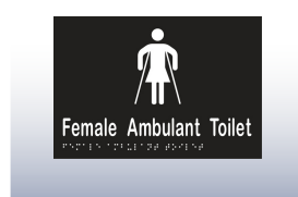
Female Ambulant Toilet Sign Code: MLS16266_BLK