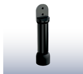
Aluminium Cubicle Leg Code: 120ALUM_DESIGNER