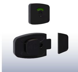
Sera Emergency Release Lock & Indicator Set Code: SERA_ERLOCK_DESIGNER

Ambulant Toilet Cubicles are designed for people with disabilities such as those using crutches or walking frames, or those with sensory loss or arthritis. In male and female facilities with more than one standard cubicle, at least one must be suitable for use by a person with an ambulant disability.