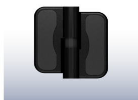
Moda Gravity Hinge Code: MODA_GRAVITY_DESIGNER