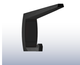
Moda Hat & Coat Hook Code: MODA_HOOK_DESIGNER