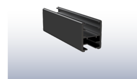
Universal Head Rail Channel Code: UNICH_36_DESIGNER